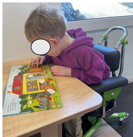
"B": Special Seating System

Young Person "A": She is 10 years old and has a diagnosis of quadriplegic cerebral palsy and other medical problems including Spina Bifida. A trike was proposed to help to develop her muscles and improve her mobility, co-ordination, and reduce her reliance on a self-propelled wheelchair. With suitable adaptations for her particular requirements, she was able to gain some independence, and with the family having already received a partial grant from another charity we contributed the balance of £990.40 required for the purchase (which was an amount reduced by our discount agreement with the supplier).