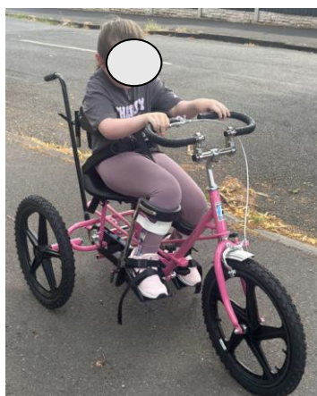
"A": Theraplay Special Trike