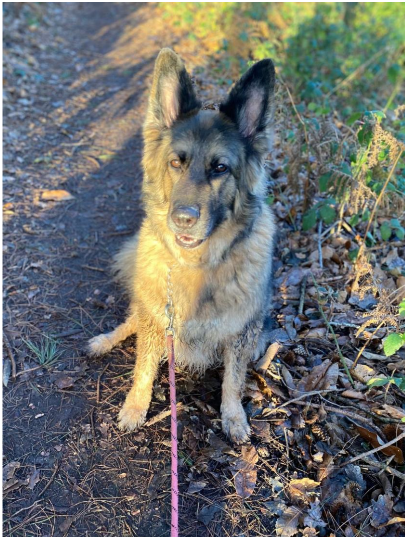
Our Mascot Keira enjoying an early evening walk