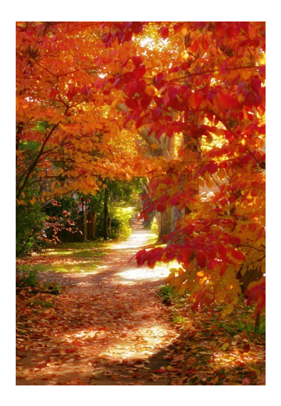
Progress Report as at 31st December 2014