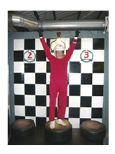
The Chairman seems pleased with a fundraising result