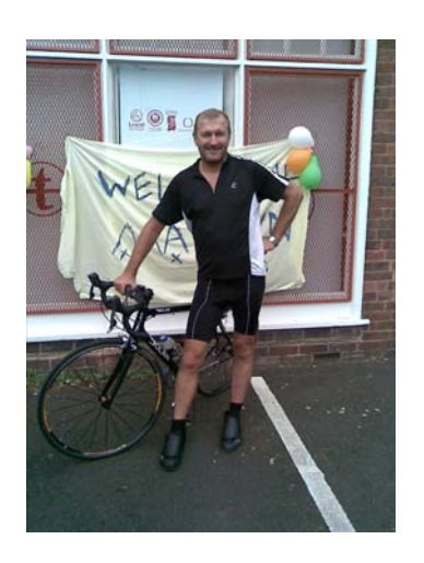
Our Legal Trustee in major fundraising mode. (140 mile sponsored ride)