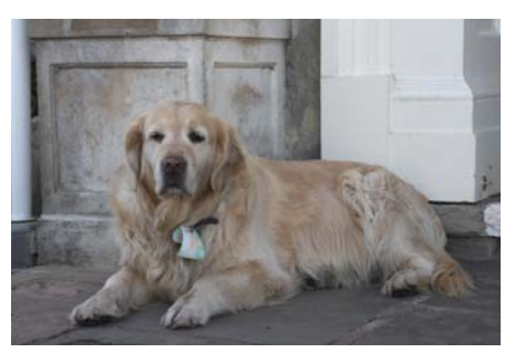
One resident without a ticket on the day