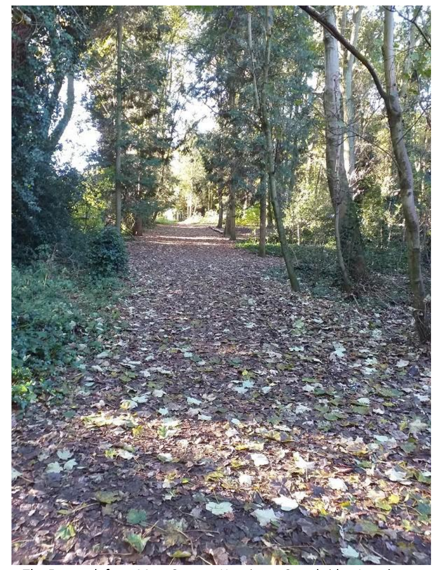
The Footpath from Mary Stevens Hospice to Stourbridge Junction