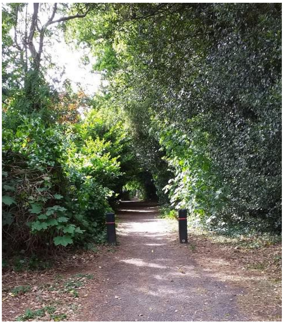
Bridle Path off Bromwich Lane, Pedmore