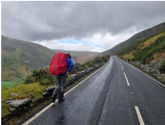
The long walk

A sponsored family event held to raise funds for the Charity after we had helped by funding a special exercise trike for their young son.