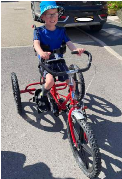
Theraplay Special Exercise Trike

With only a small number of suppliers in the market for many types of special needs equipment, we often receive requests involving the same supplier. In some cases we are able to agree a useful discount structure for all purchases made, which helps us to spread our funds further